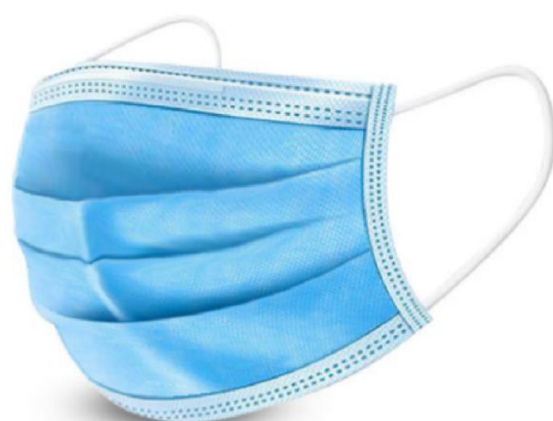
Model #: MSK-F1CO